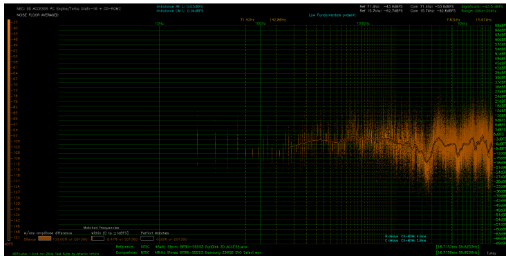
Figure 2 SanDisk Ultra 400GB vs the Samsung EVO Select 256GB

For some context, here is the SanDisk Ultra 400GB vs the Samsung EVO Select 256GB—differences plotted in the frequency domain with average line drawn to highlight the Samsung’s fairly consistent lower SD access noise across the spectrum.